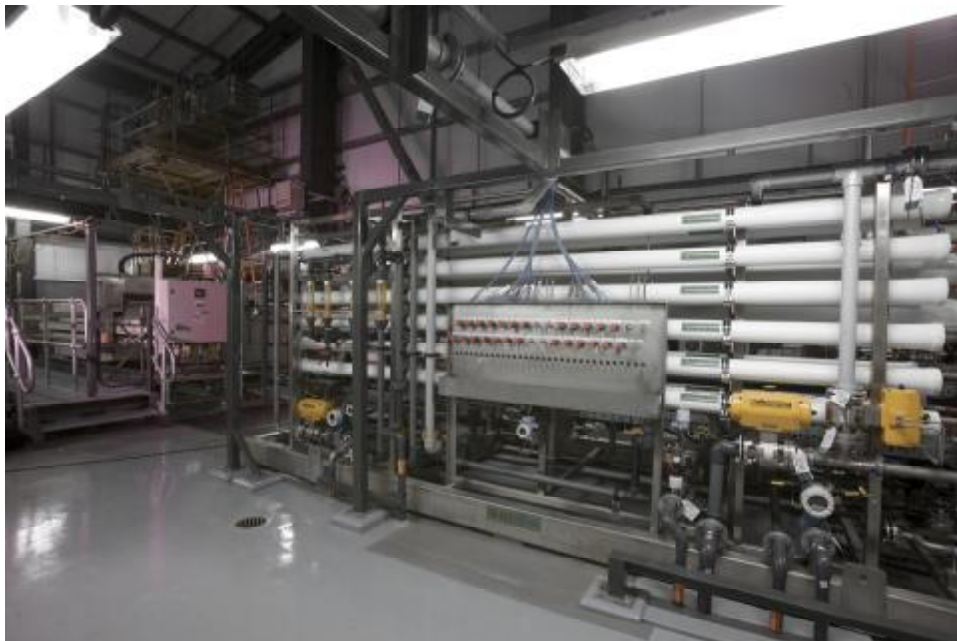
Membrane Skid for Ultra-filtration Membranes