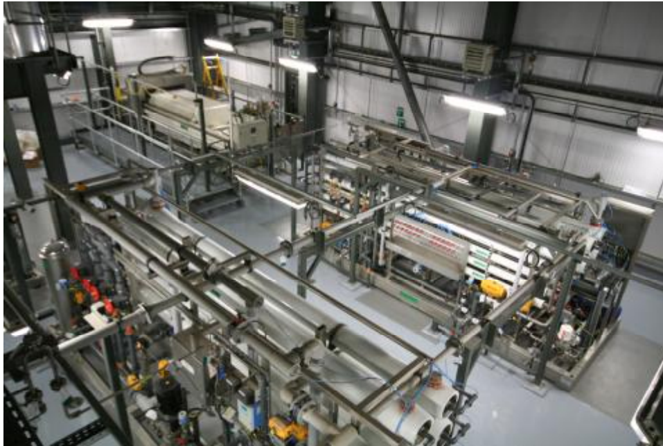
Showing membrane skids and filter press